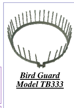
Bird Guard Model TB333