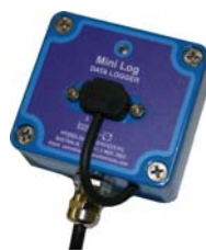
MLI-FL Data Logger