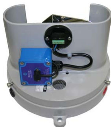
TB3 Base with optional ML1-FL

The Tipping Bucket Raingauge can be used in conjunction with Hydrological Services data logger model ML1-FL. The logger is rugged and compact, it records the date and time of occurrence of tips from the raingauge up to 100,000 events with 1 Second Resolution can be stored in the ML1-FL's memory. The data is stored in a flash EPROM.