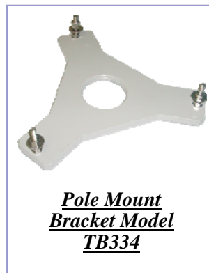
Pole Mount Bracket Model TB334