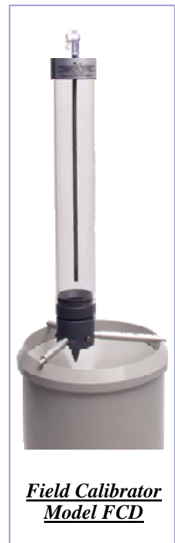
Field Calibrator Model FCD